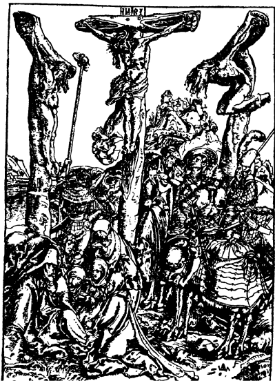
LUKAS CRANACH. CRUCIFIXION (1502).