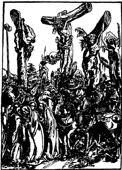
LUKAS CRANACH. CRUCIFIXION.