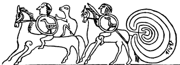
THE RIDERS COMING FROM THE CITY OF TROY. (Picture from a Pitcher from Tragliatella.)

("Palace of the Intestines" it is called in the inscriptions deciphered by him). The analytic conception of these as the prison of the mis-shapen form (embryo) unable to find the exit, is clear in the sense of unconscious wish fulfilment. Whilst I reserve for a larger work 1 a detailed demonstration of this conception, the consequences of which are of immense importance for the understanding of other periods of culture (not only of the Cretan-Mycenean, but also of Northern) and of art (Labyrinth dances, Ornamentation, etc.), I would like