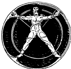
IXION ON THE WHEEL.

through the air, lashed by the scourge and the exclamation 'Benefactors should one honour.' This punishment for Ixion seems doubly hard in so far as he is immortal." 1 Similarly, Tantalus, a "personification of abundance and riches," is punished on account of his transgressing insolence towards the gods with whom he desires to be equal. The original version, in which a stone hangs above his head always threatening to fall down, shows a permanent anxiety